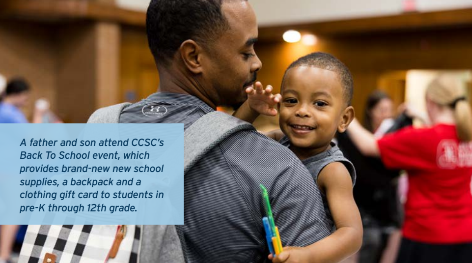
A father and son attend CCSC's Back To School event, which provides brand-new new school supplies, a backpack and a clothing gift card to students in pre-K through 12th grade.